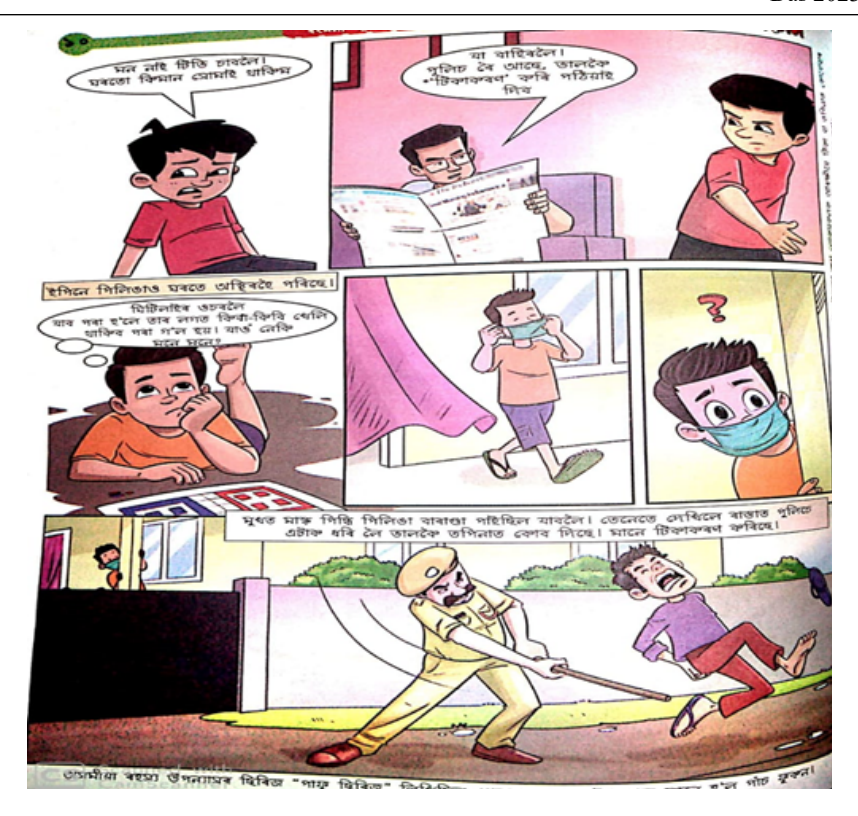
Fig.2. Panels with words from: 'Oghaitong Ghitilair Oghoton'. Rongmon, July-August-September 2020, p. 10.

The words inscribed within the panels are in Assamese, therefore the textual narrative of the comic book is meant to be understood by people fluent in the language. Of course, the images give us a sense of what the story might be about, but "the presence of verbiage in the same view or field of vision as the pictures gives immediacy to the combination, breathing the illusion of life into the medium" (Harvey 28). This presence is greatly felt when the verbiage is in a language which might not be understood by many readers who wish to delve into it. The images are the only aspect that they might understand and therefore interpret the panels accordingly, but the text gives "nuance to the pictures" (Harvey 30). With the inclusion of Assamese words in the panels shown above, this nuance is realized to a greater extent. We get to know the names of the two boys who want to go out during the pandemic, and the father of one of the boys ironically tells his son to go out so that he can get beaten by policemen. The words