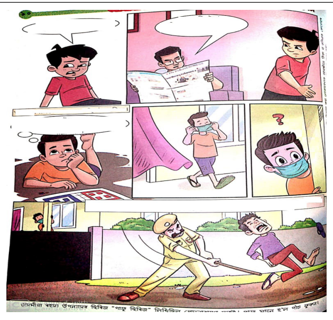
Fig.1. Panels without words from: "Oghaitong Ghitilair Oghoton'. Rongmon, July-August-September 2020, p. 10.

Without the inscription of words as captions and word balloons, the action of narration falls completely on the images included in panels. Since the characters are all humans in the frame shown above, the plot can be interpreted to a degree through their anatomies since "...the human form and the language of its bodily movements become one of the essential ingredients of comic strip art" (Eisner 101). In the first panel of the frame above, the first boy's facial emotions lets the readers realize that he is probably bored and irritated. A second boy wears a surgical mask in the fourth and fifth panel, giving us an idea that the story is probably related to the pandemic. The last panel shows the second boy looking at another boy probably of his age being beaten by an angry-looking policeman because of his refusal to wear a mask. Therefore, the panels can be interpreted with the relationship that they have with each other.